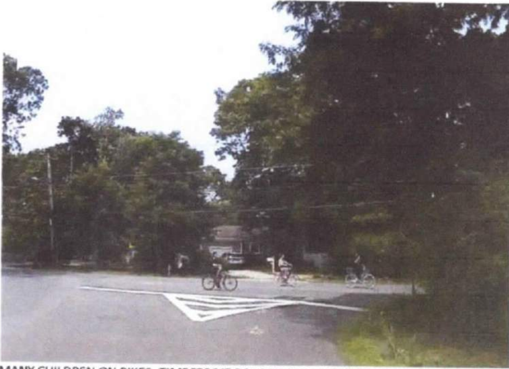
MANY CHILDREN ON BIKES- TIMBERPOINT ROADS HAS AN ELEMENTARY SCHHOOOL DOW A FEW BLOCKS