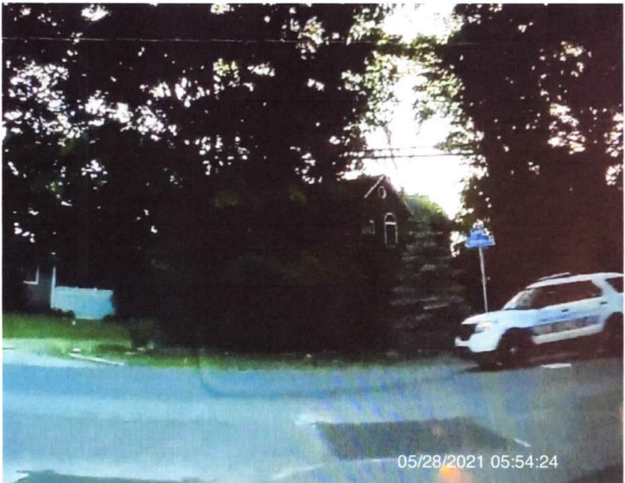
ISLIP PARK RANGER BLEW RIGHT THREW STOP SIGN