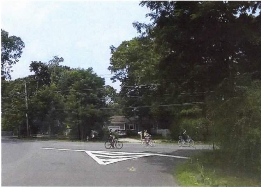
MANY CHILDREN ON BIKES- TIMBERPOIT ROAS HAS AN ELEMENTARY SCHHOOOL DOW A FEW BLOCKS